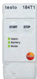
testo 184 T1