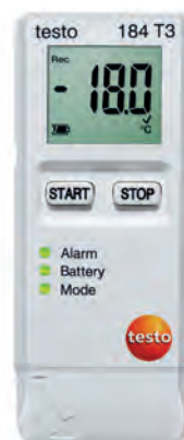
testo 184 T3