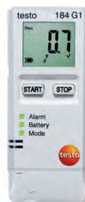
testo 184 G1