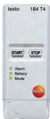
testo 184 T4